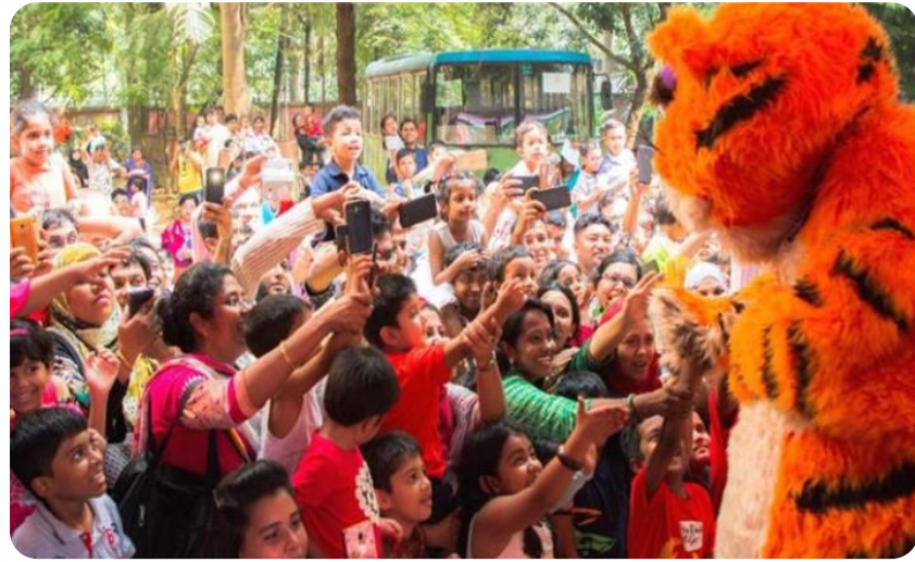
Kids Time Fair 2018