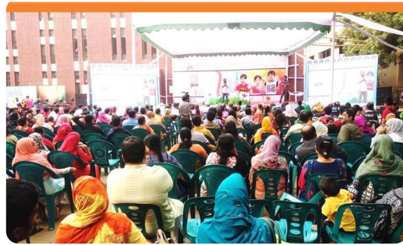
Kids Time Fair 2019