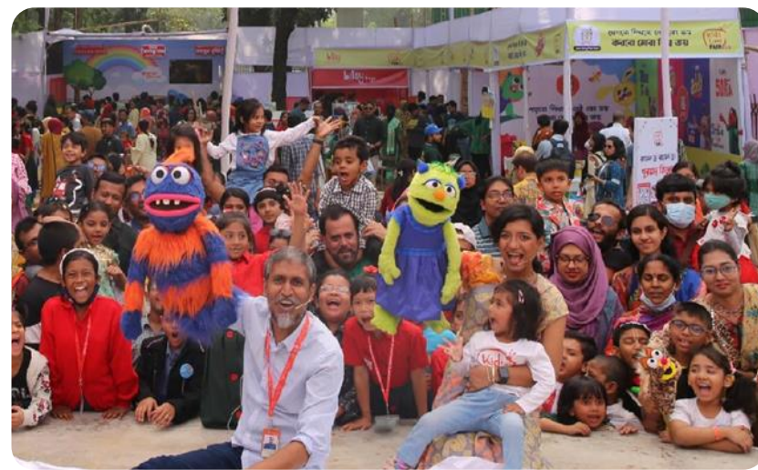
Kids Time Fair 2024