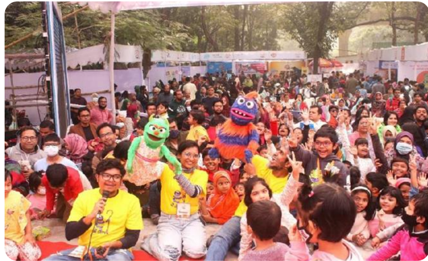
Kids Time Fair 2023